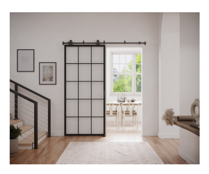
*Door panel is for reference only and is not included. Color may vary from the images shown

Leveraging more than 120 years of heritage, our No.108 sliding door track systems have been re-engineered for the 21st-century consumer to assure authentic and lasting architectural significance. These commercial quality hardware systems are available in two standard lengths and can accommodate 1-3/8" to 1-3/4" thick doors weighing up to 175lbs when installed properly. Each system is individually packaged and includes a 1" diameter track assembly with mounting brackets, No.1 cast iron door hangers, soft-stop system, blade style floor guide and installation hardware.